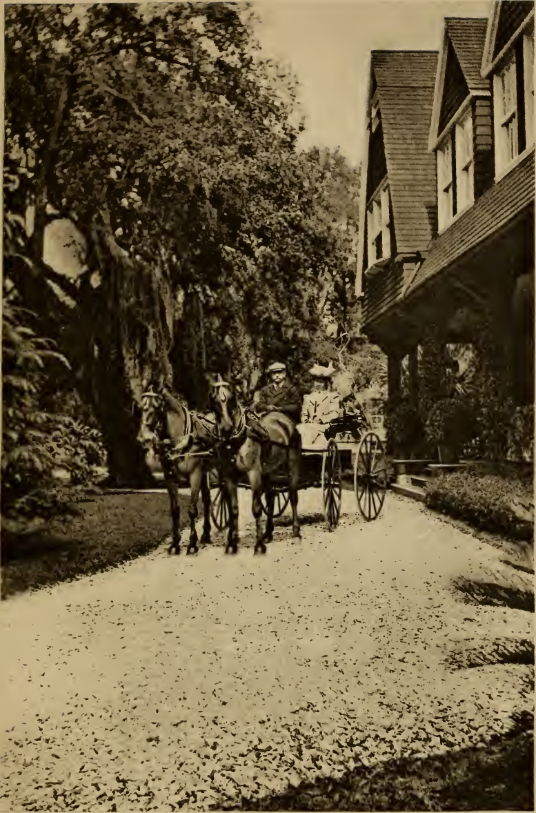
PAIR OF HORSES IN FRONT OF HOUSE.